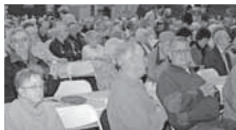
Large crowd gathered for 71st Annual Meeting of Members

How would this affect the average consumer? In a scenario using the