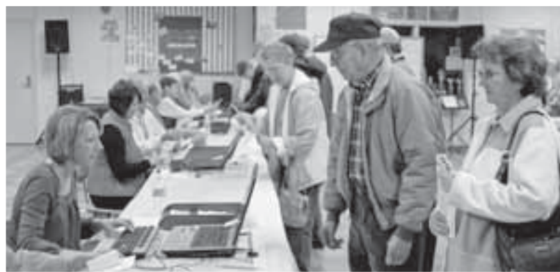
Norris employees registering members as they arrive for meeting