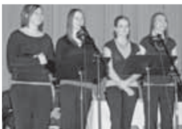
Dieterich Unit 30 School Musicians provided entertainment